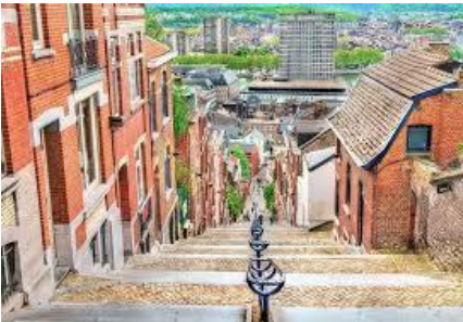
Liège (the Buren Stairs...)