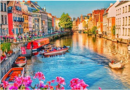
Bruges (Old Quarter)