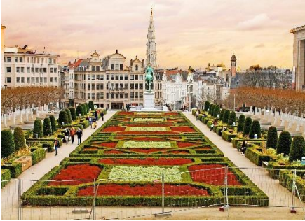
Mont des Arts Gardens (Brussels)

Here are some other places we recommend: