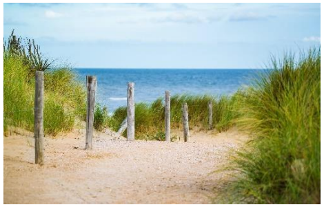
The Zwin (North Sea nature park)