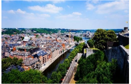
Namur (the Meuse)