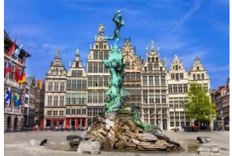
Antwerp (the main square)